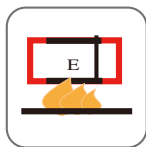
Circuit Integrity IEC 60331-23/BS 6387(Optional)